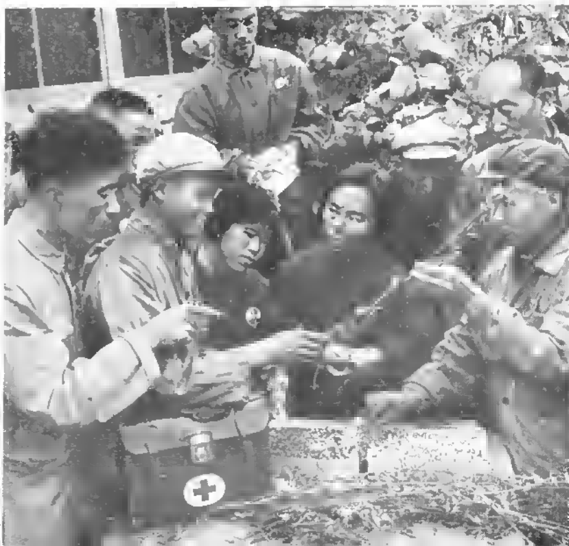
A worker-led investigation group from a pharmaceutical plant studies peasants' needs deep in the countryside.

To the pharmaceutical and commercial workers who send the medicines to the countryside, the peasants often say, "What you've brought us is more than medicines. It's the supreme concern from Chairman Mao for the well-being of us poor and lower-middle peasants." And they express their gratitude by cheering, "Long live Chairman Mao! A long, long life to him!"